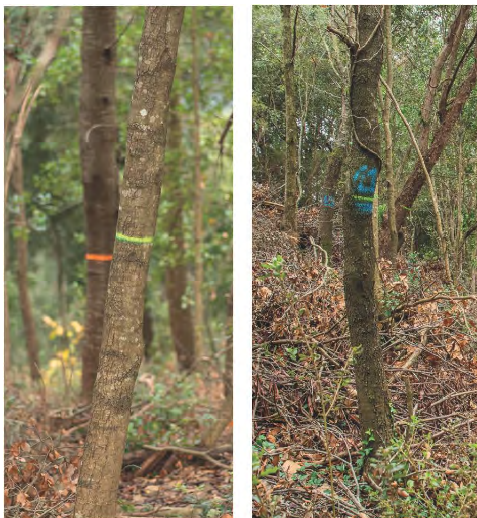
Figure 3. left (foreground): tree with an inclination of 10°; right: tree with curvature of 3 cm/m